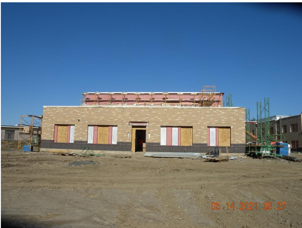
Building F East elevation.