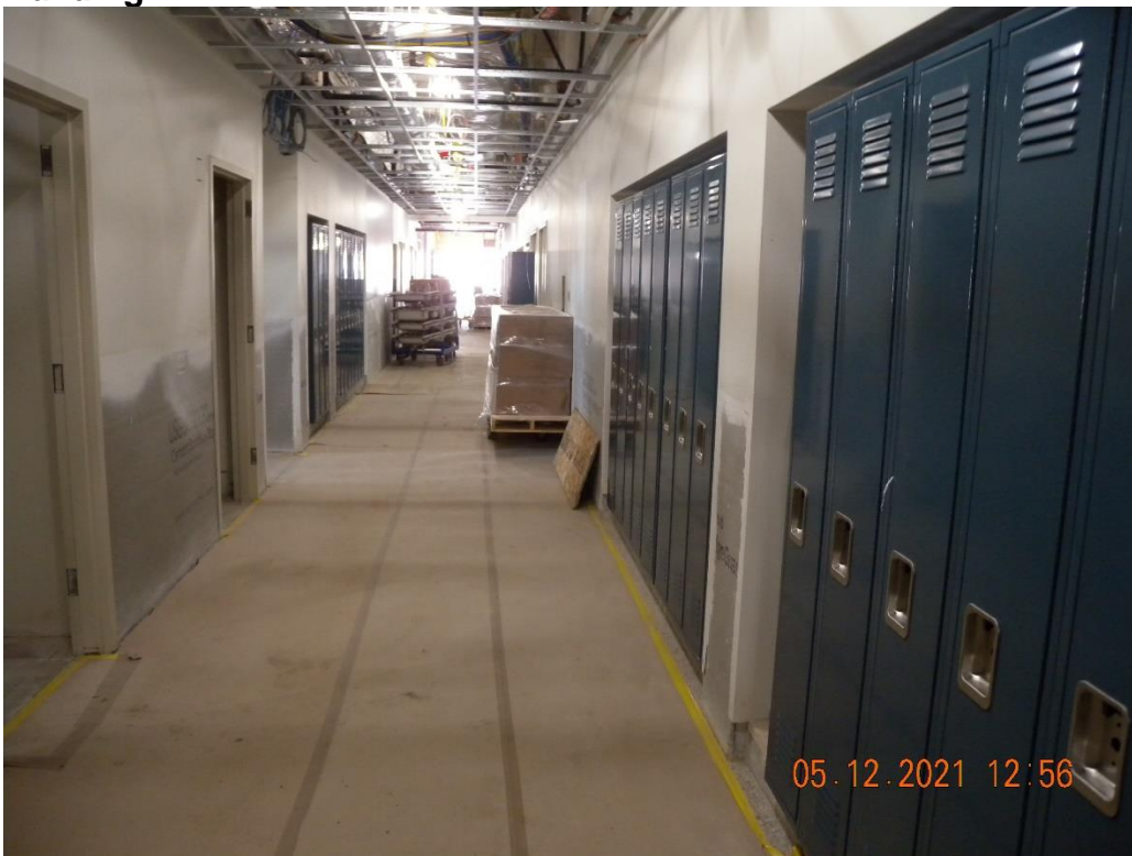
First floor building B.