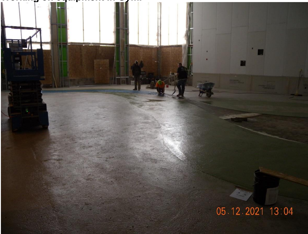
Working on terrazzo in elementary cafeteria.