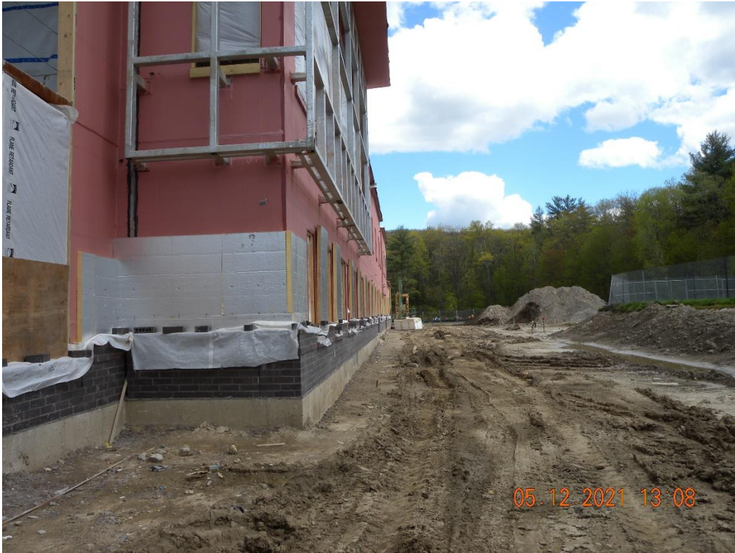
Building F South elevation.