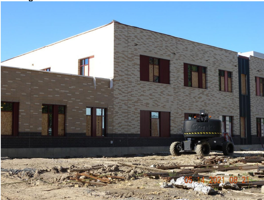
Building D, North elevation.