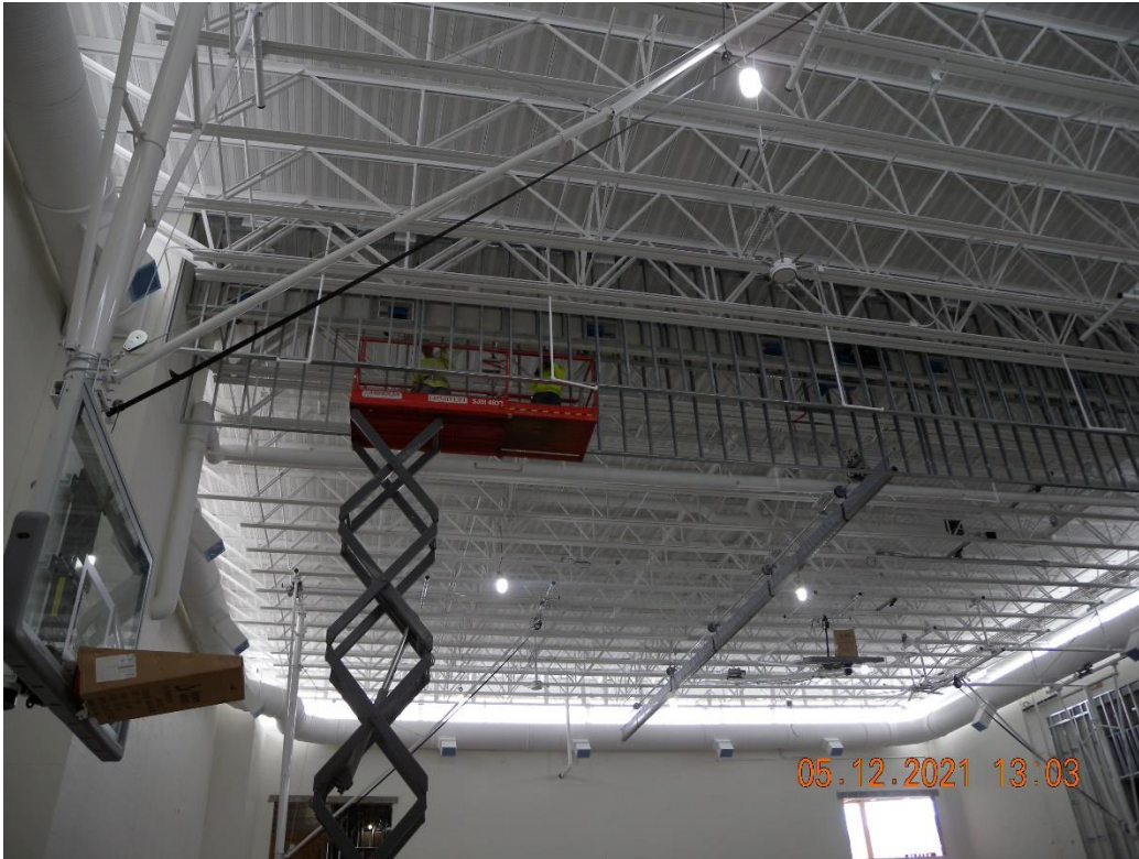
Working on equipment in Gym.