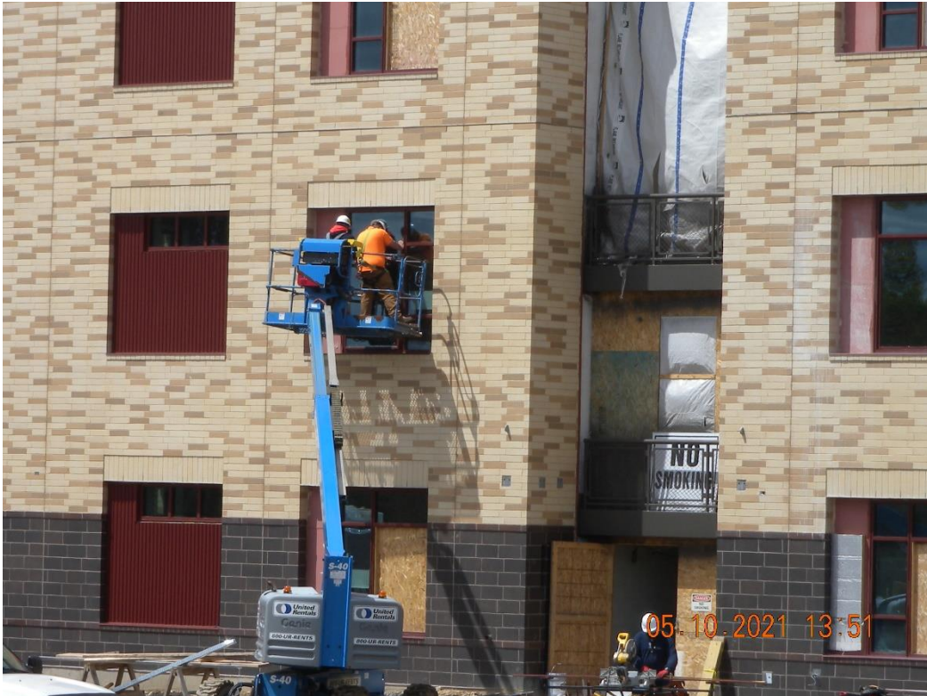
Installing glazing at building B.