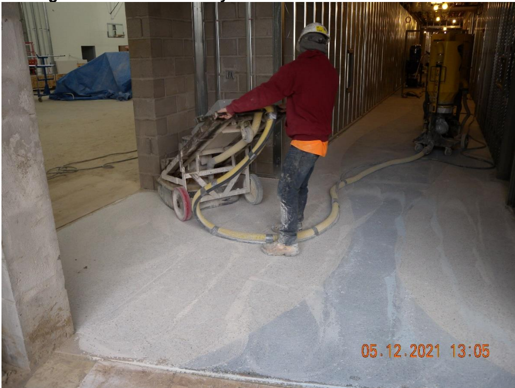
Grinding/polishing terrazzo flooring at corridor.