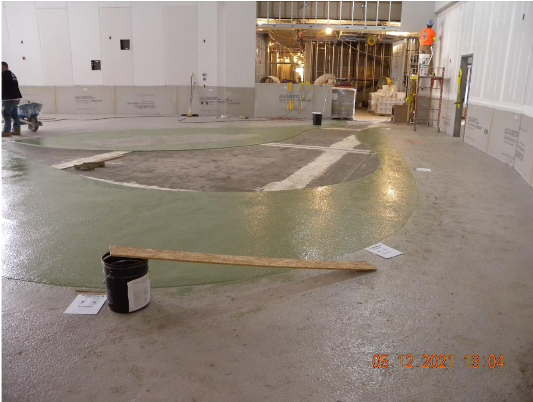
Placing terrazzo at elementary cafeteria.