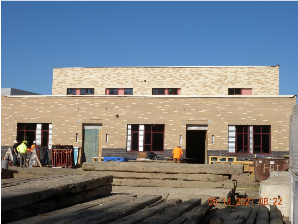
Building D East elevation installing curtainwall/windows.