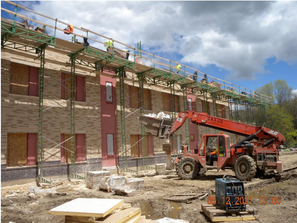
Mason's finishing South elevation of building E.