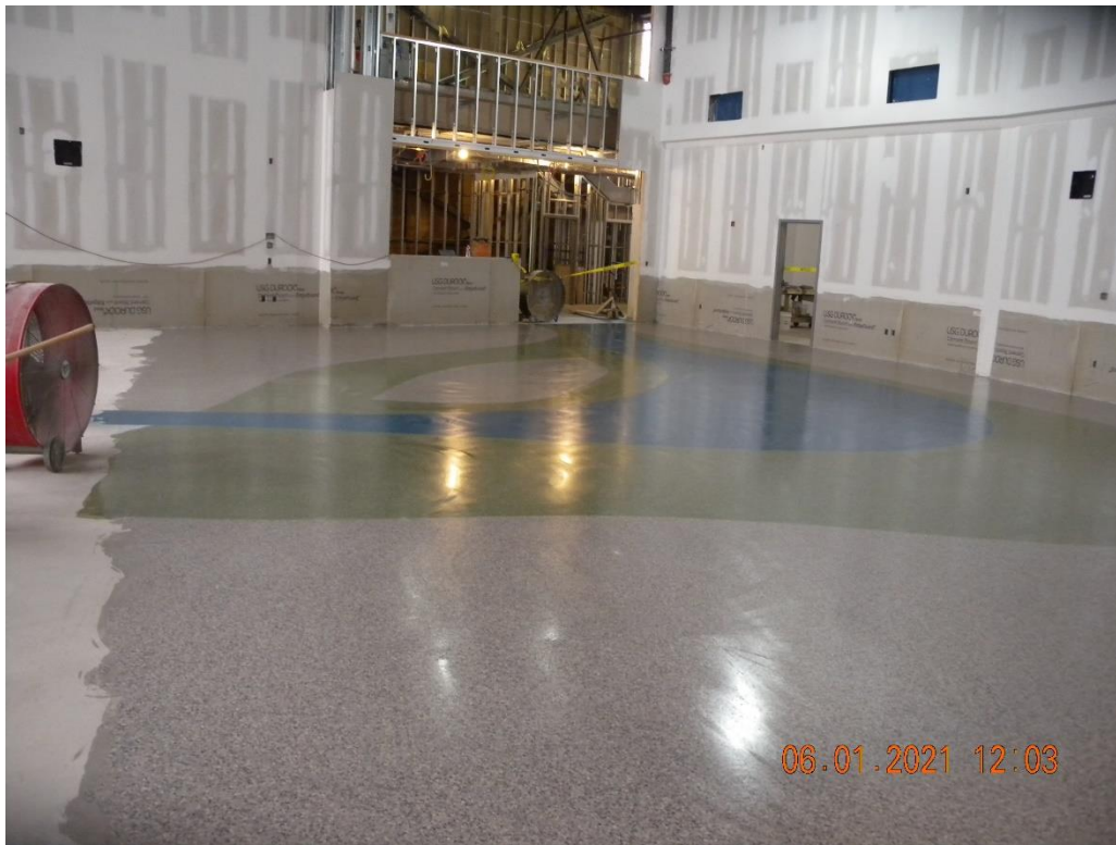
Terrazzo flooring at Cafeteria