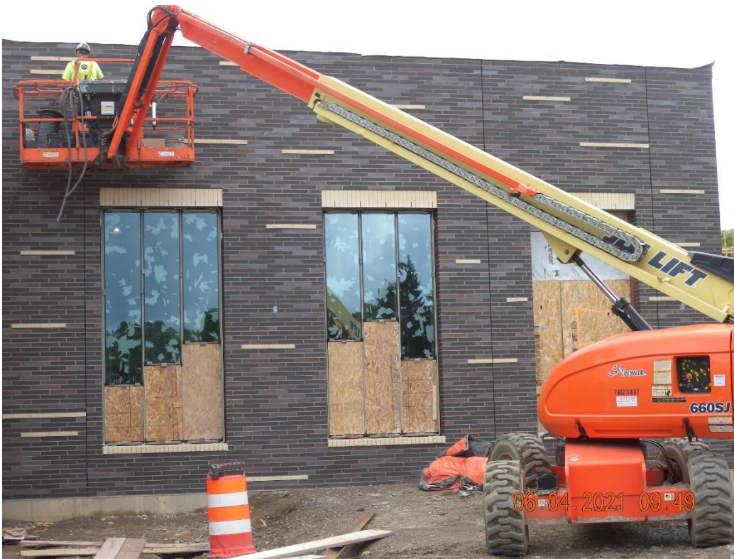
Installed some glass panels at building A.