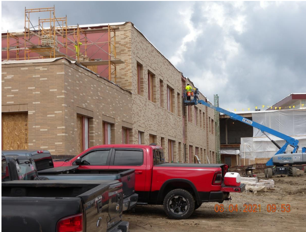
Building F North Elevation.