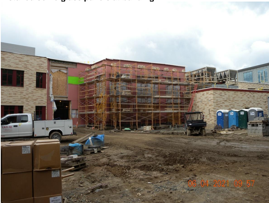
Last section of brick to do at building C North elevation.