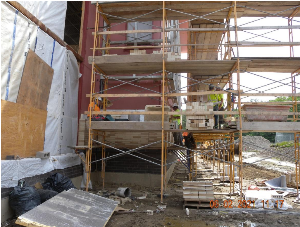
Masons at Building F SW corner.