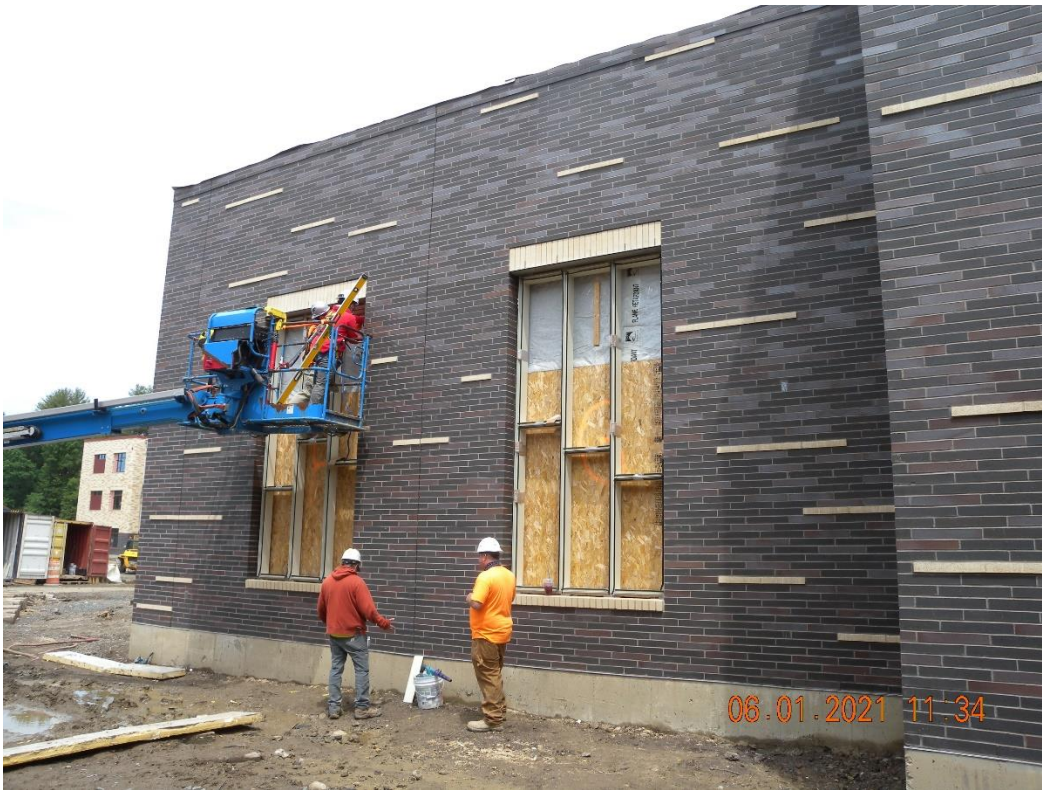
Installing curtainwall building A South elevation.