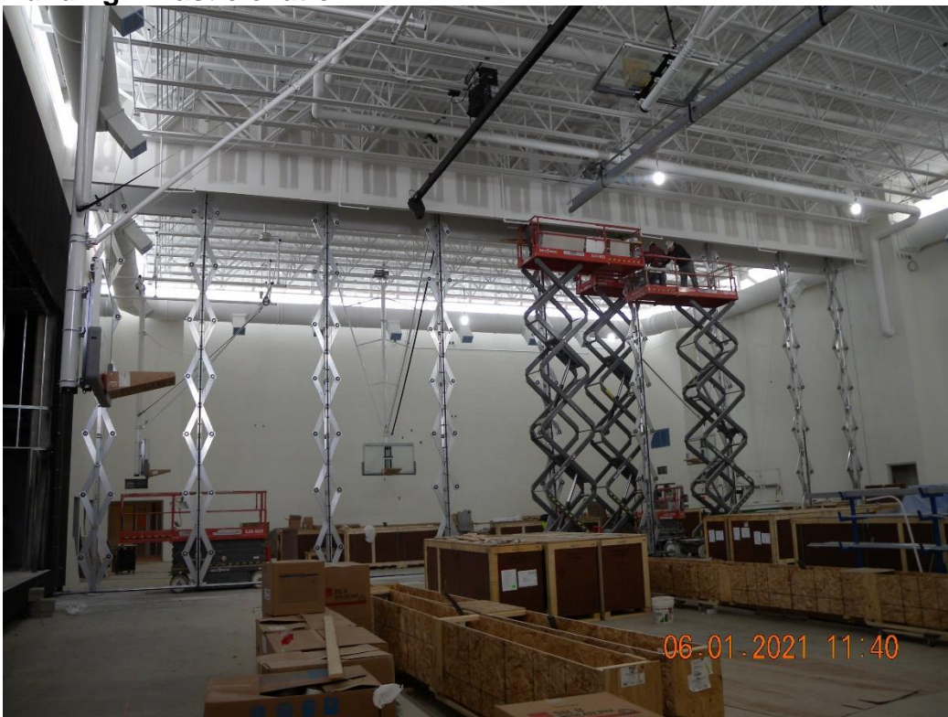
Installing Skyfold folding Gym Door.