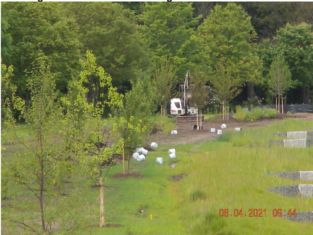
Plantings at entrance road.