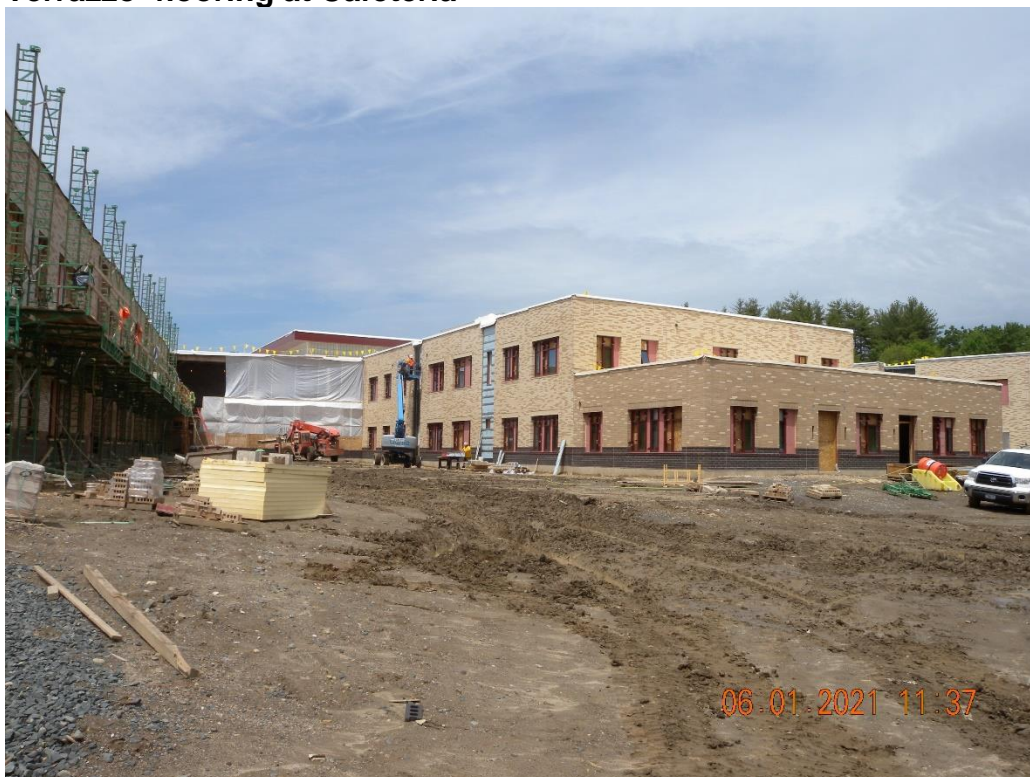
Building E SE corner.