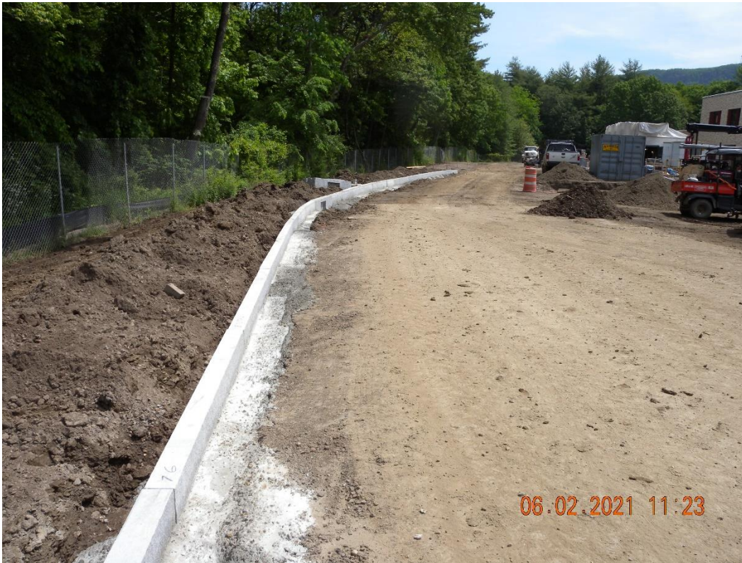
Installing Curb at the Rear of building B.