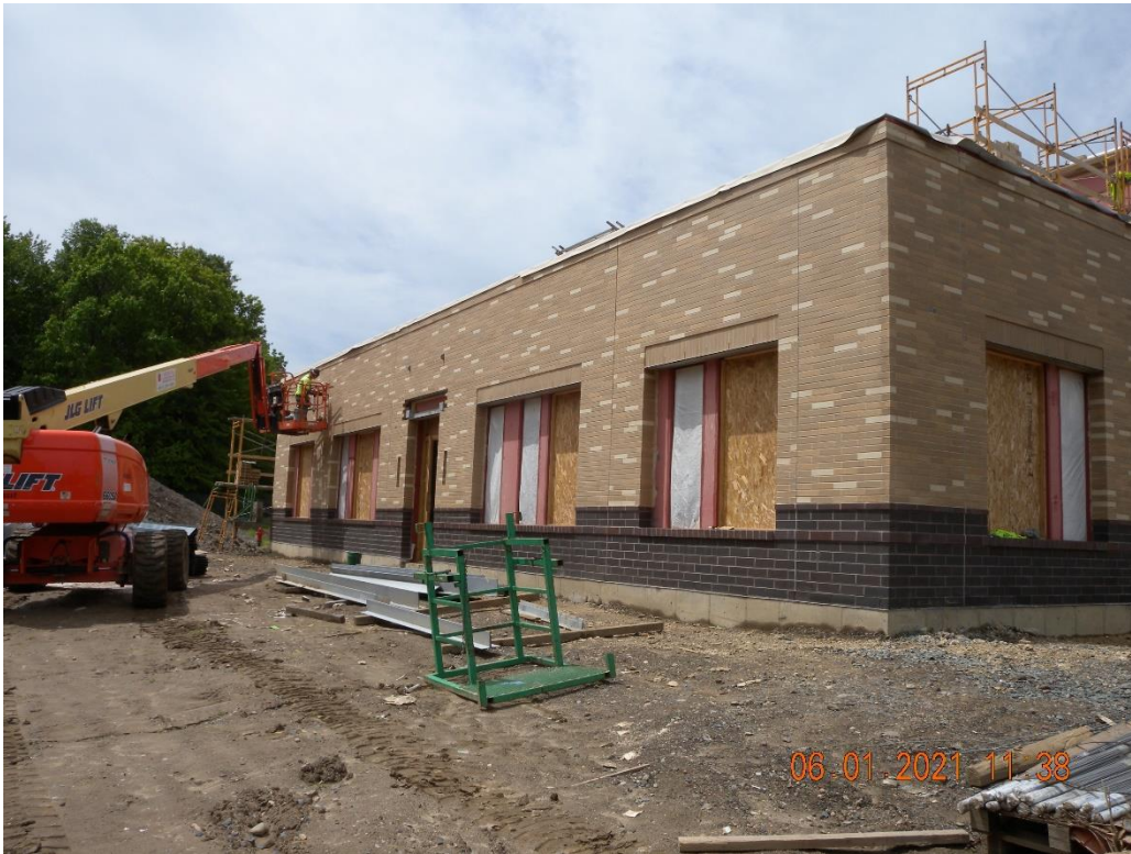
Building F East elevation.