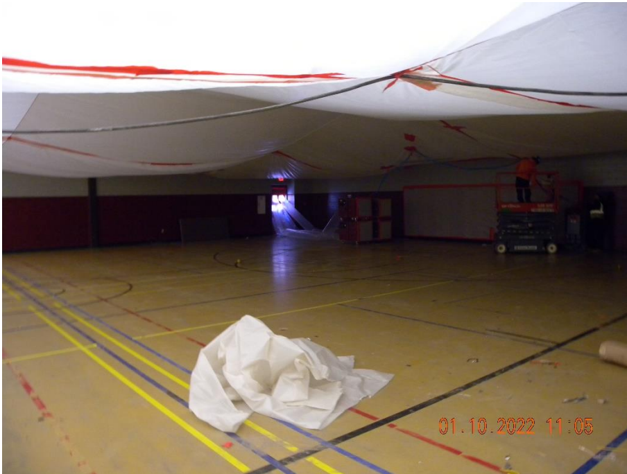
Preparing Gym floor at WB for abatement.