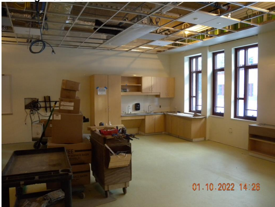
Building E classroom.