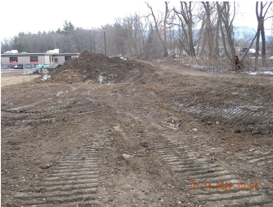
Along the South boarder of the property.