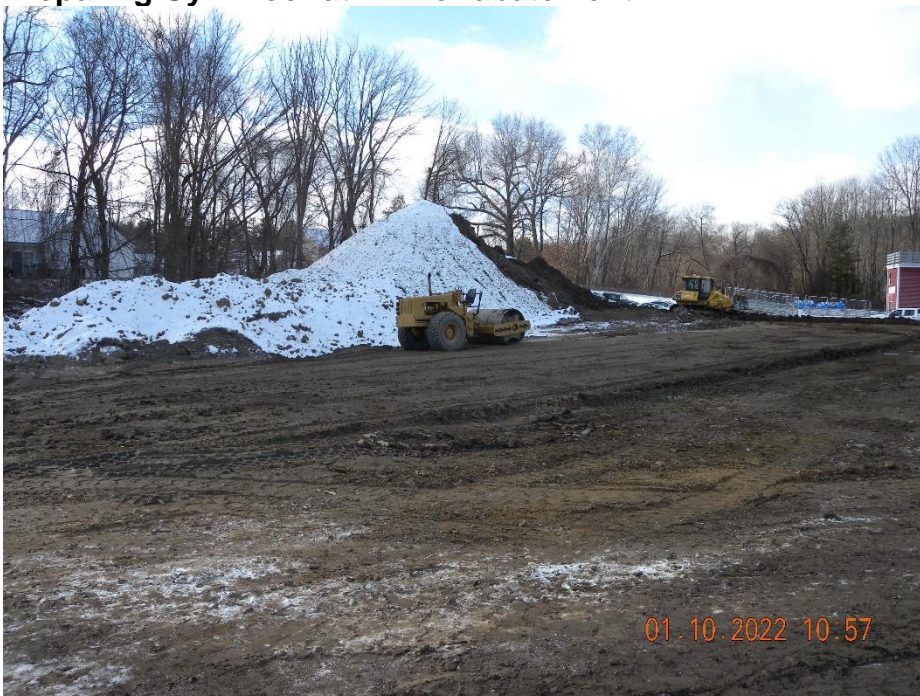
Filling area at future field.