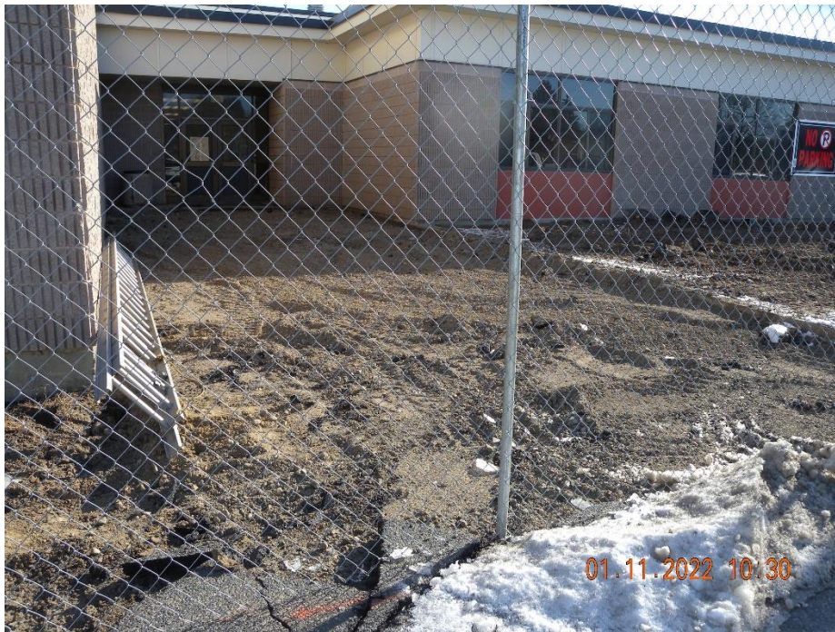
Misc. exterior demo at WB.