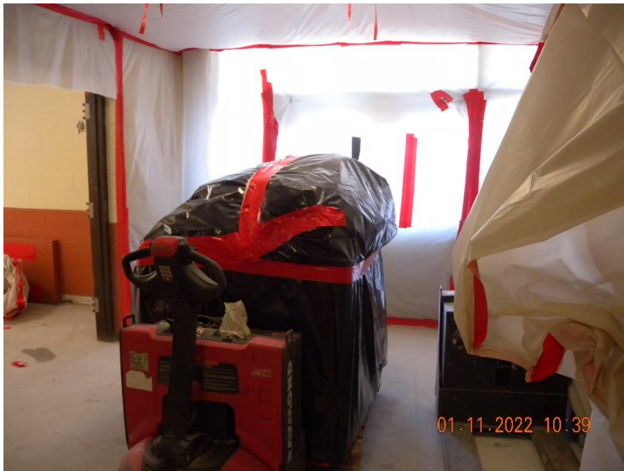
Abated material ready for the truck at WB.