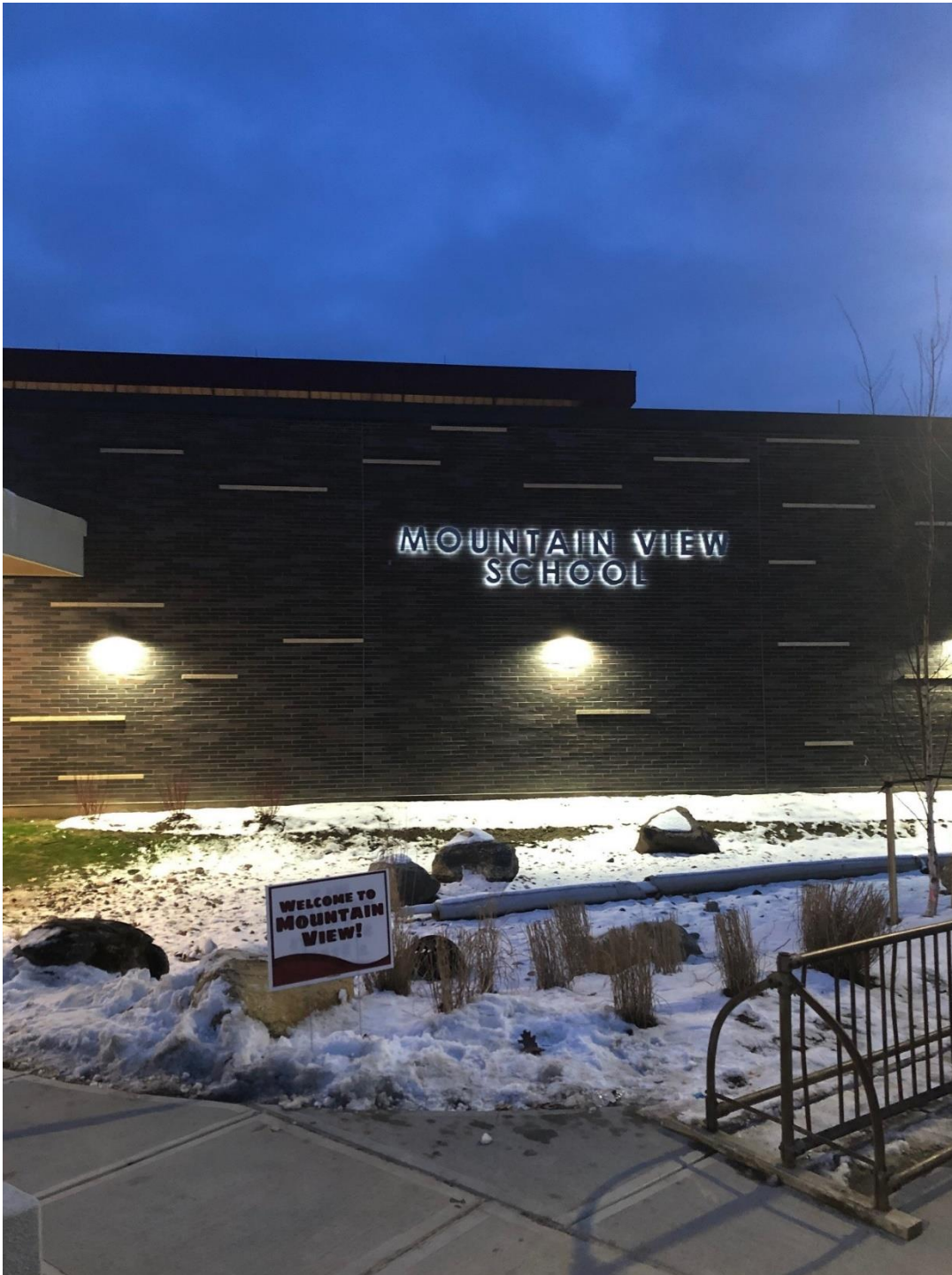
Front elevation/ Mountain View School sign.