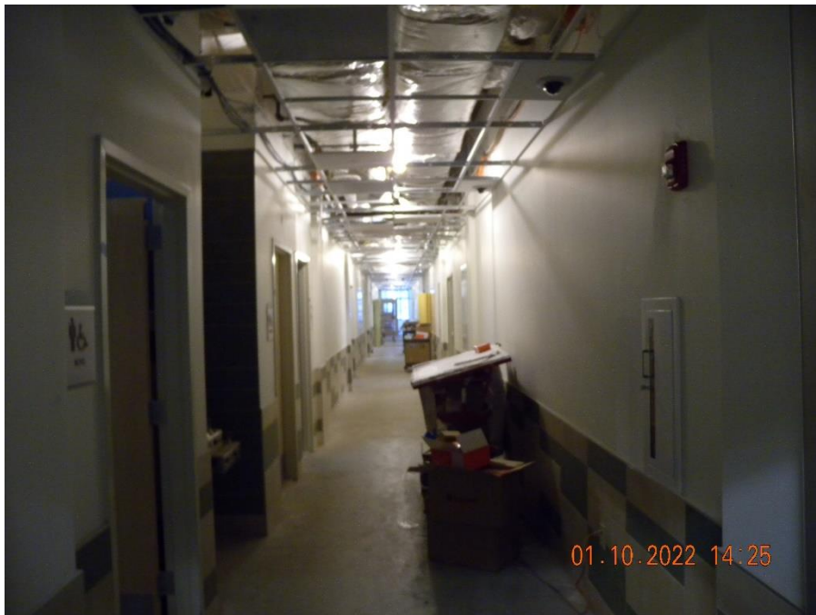
Building E corridor.