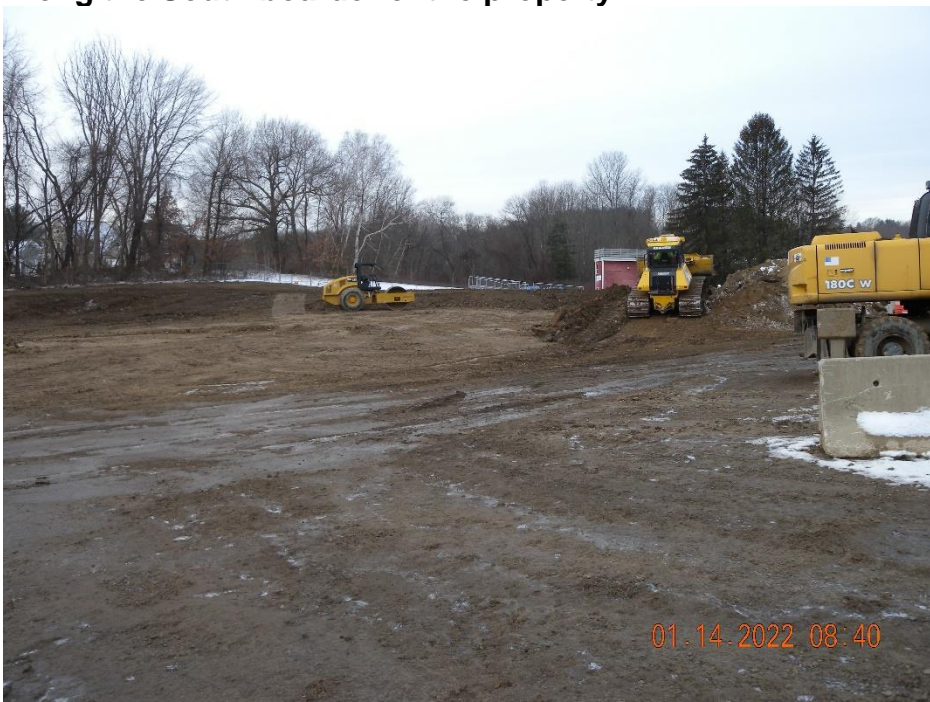
Grading, filling areas as required.