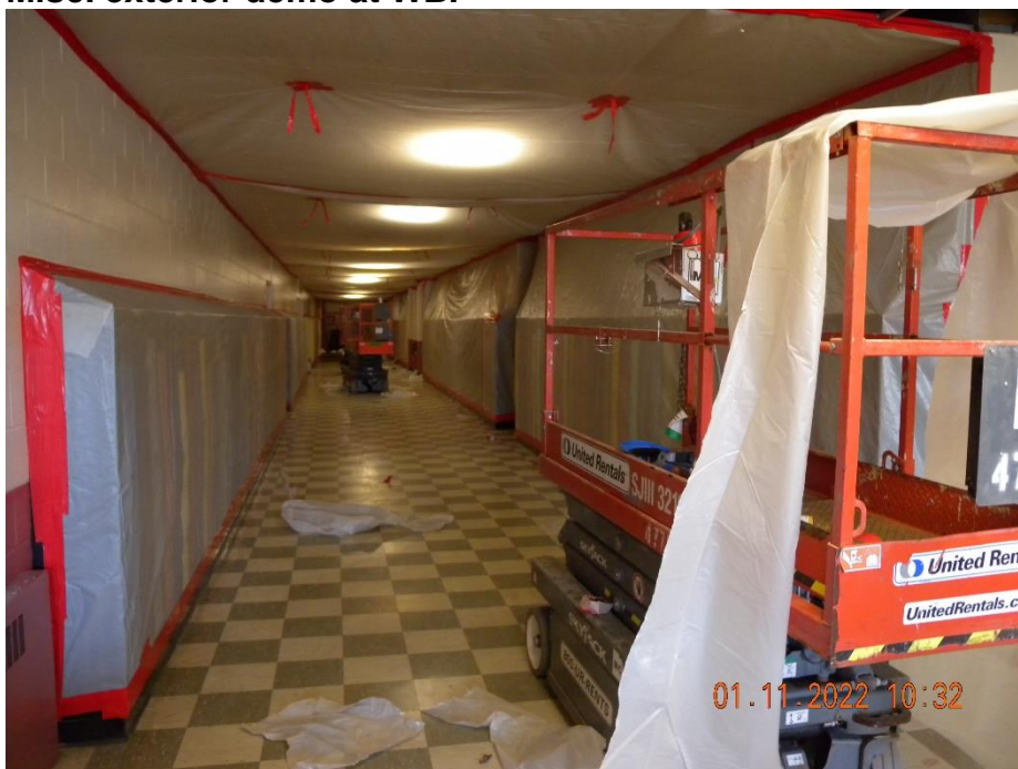
Preparing areas for abatement at WB.