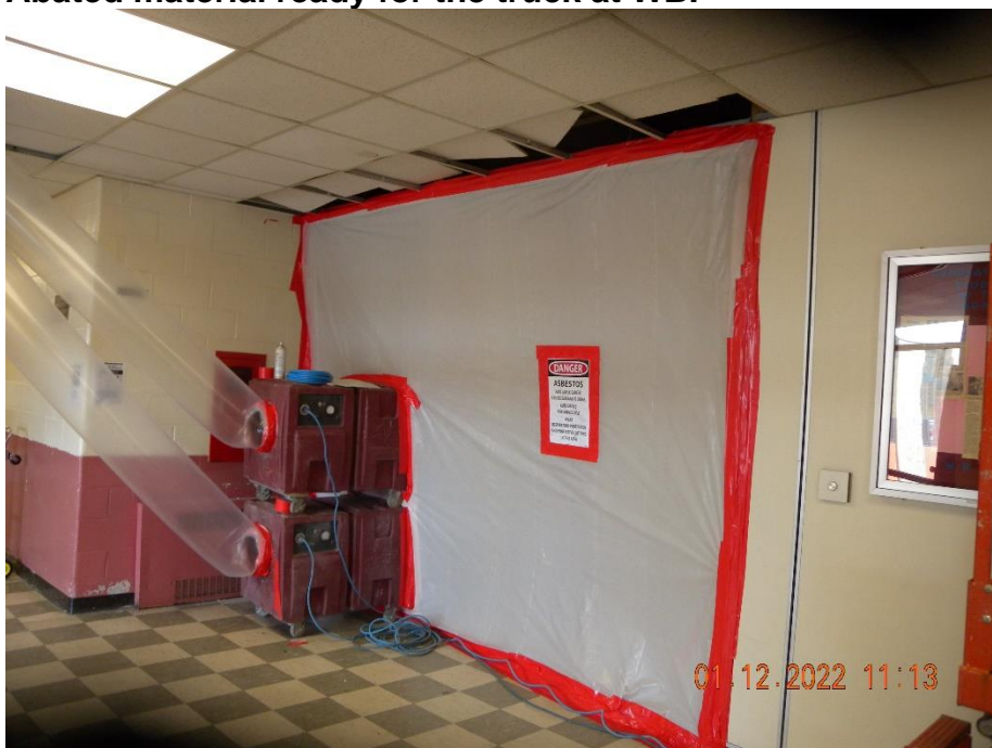
Abating material in Auditorium.