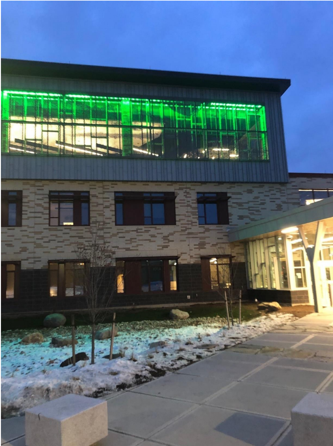
Front/Media center lite up.