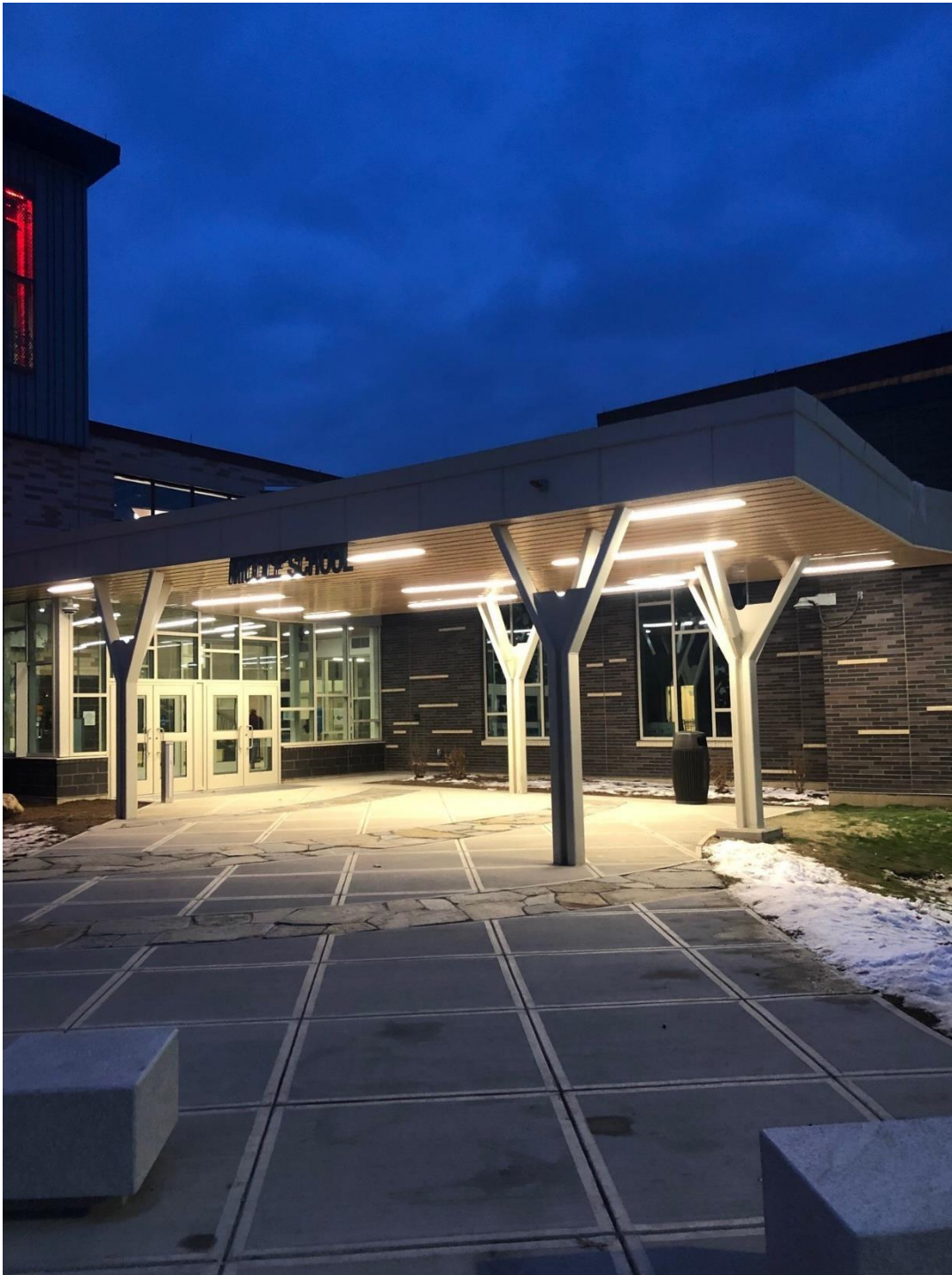
Middle School Entrance.