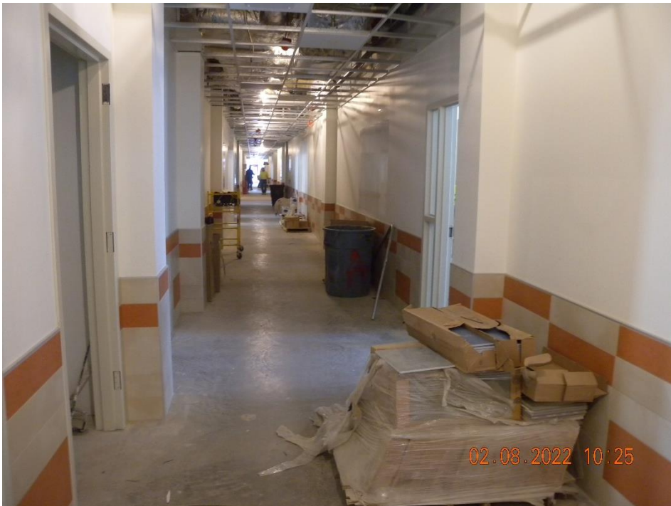
Building F Corridor.