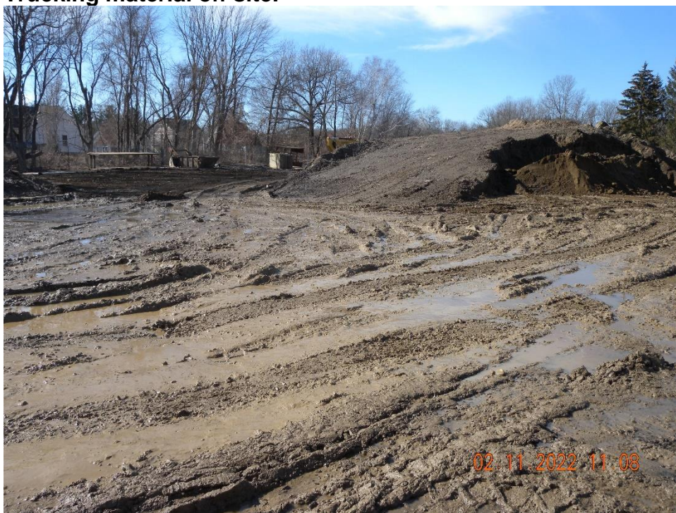
Area of the which the new field is going.