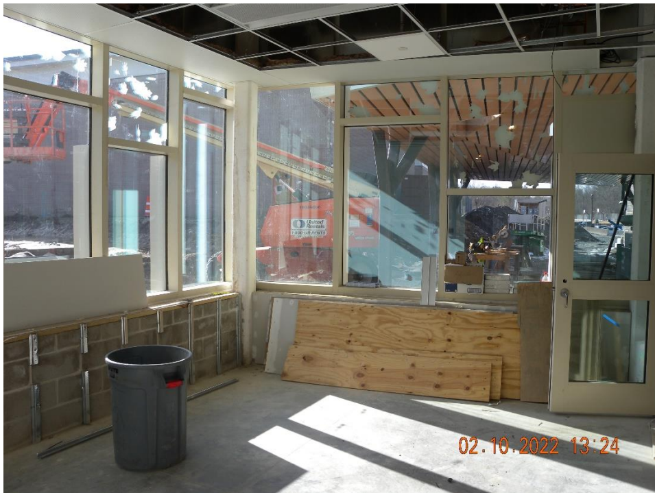
Media Center/Lounge building F.