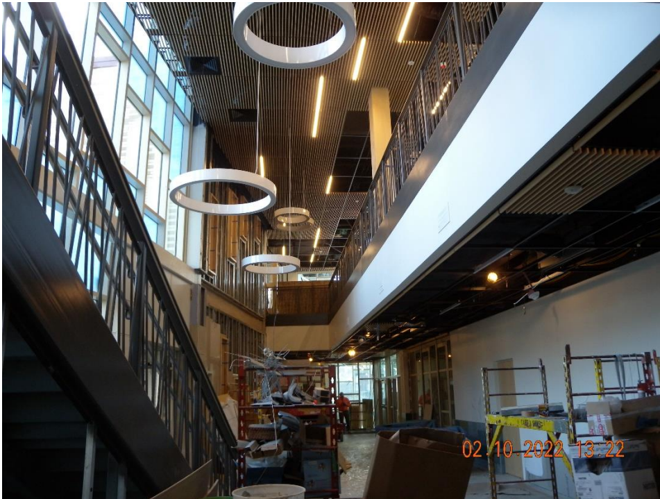
Work at corridor to F building.