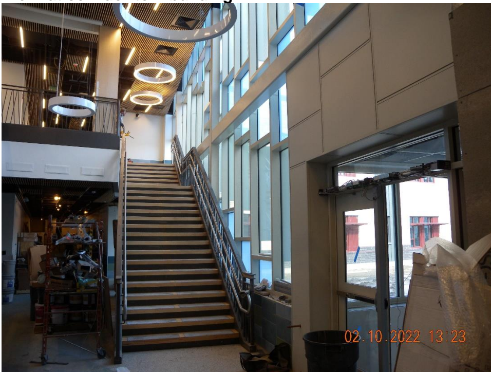
Stair between buildings E and F.