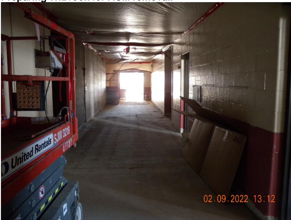
Preparing W.Brook for ACM removal.