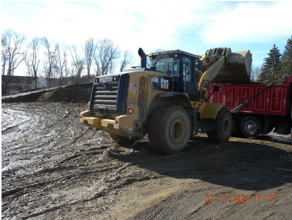
Trucking material off site.