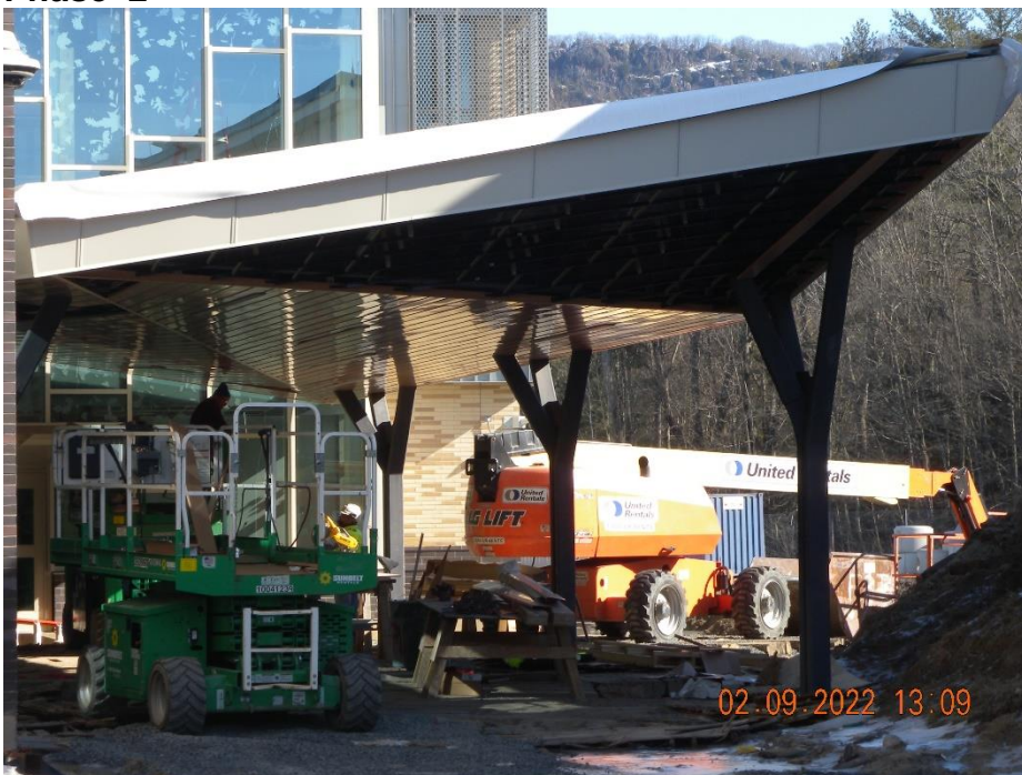
Work at the elementary canopy continues.