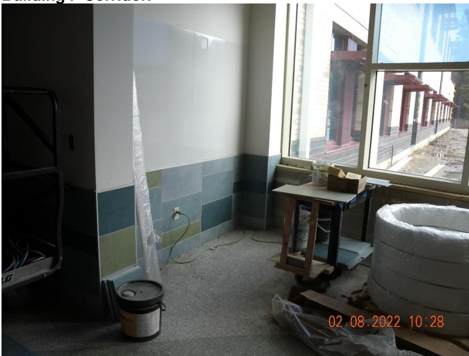
Corner at main Corridor.