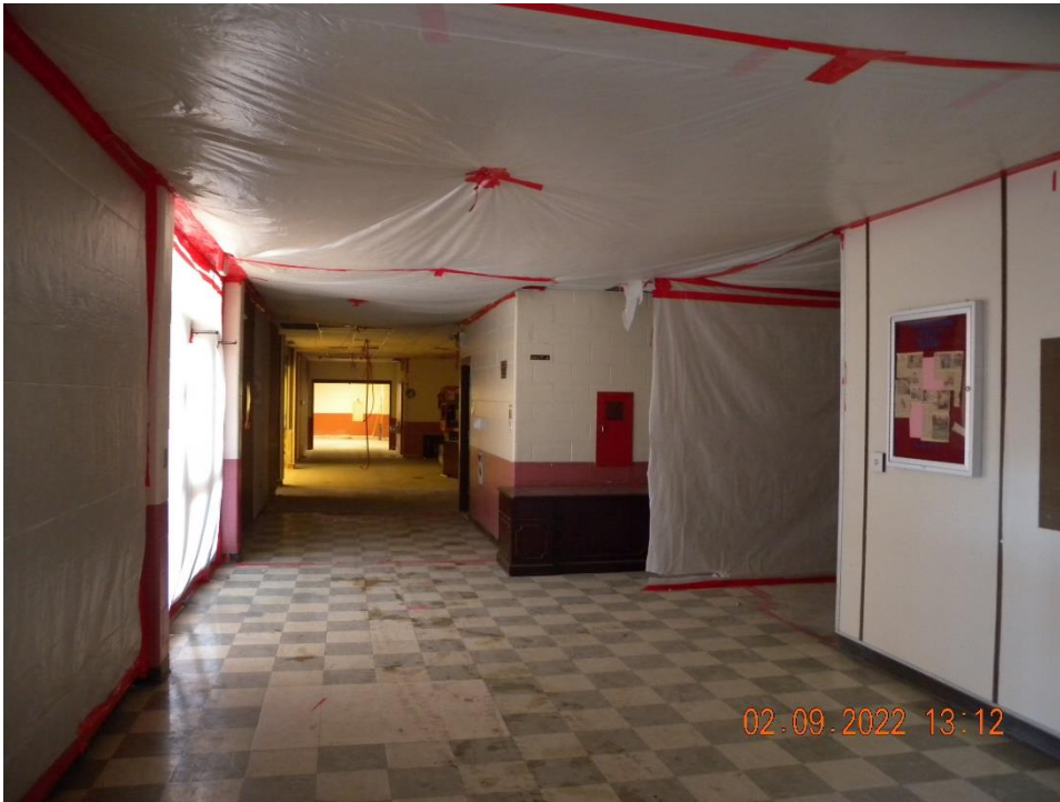
Preparing W.Brook for ACM removal.