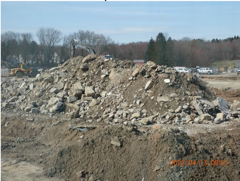
Demo of whitebrook is complete.