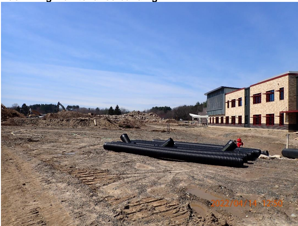
Building F, looking NWest.