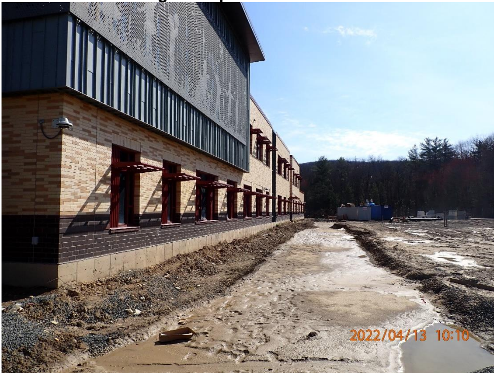
Building F looking East.