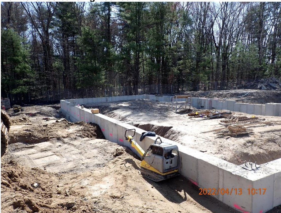
Maintaenance building Foundation.