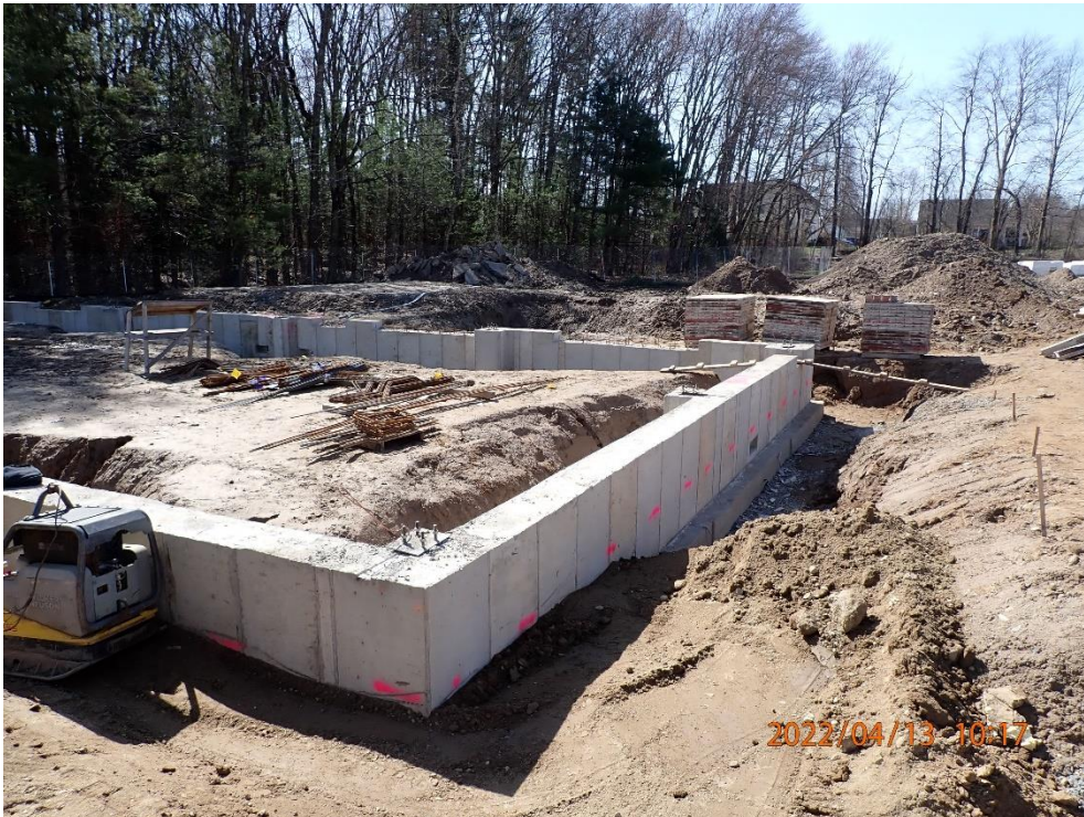
Maintenance building Foundation.