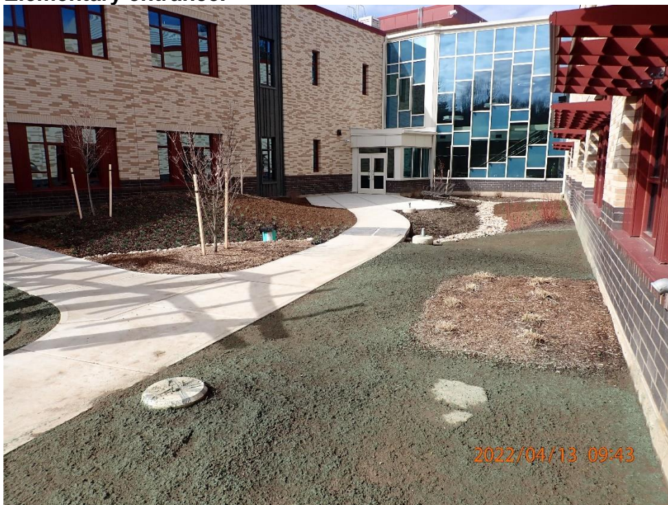
Plantings between buildings D and E.