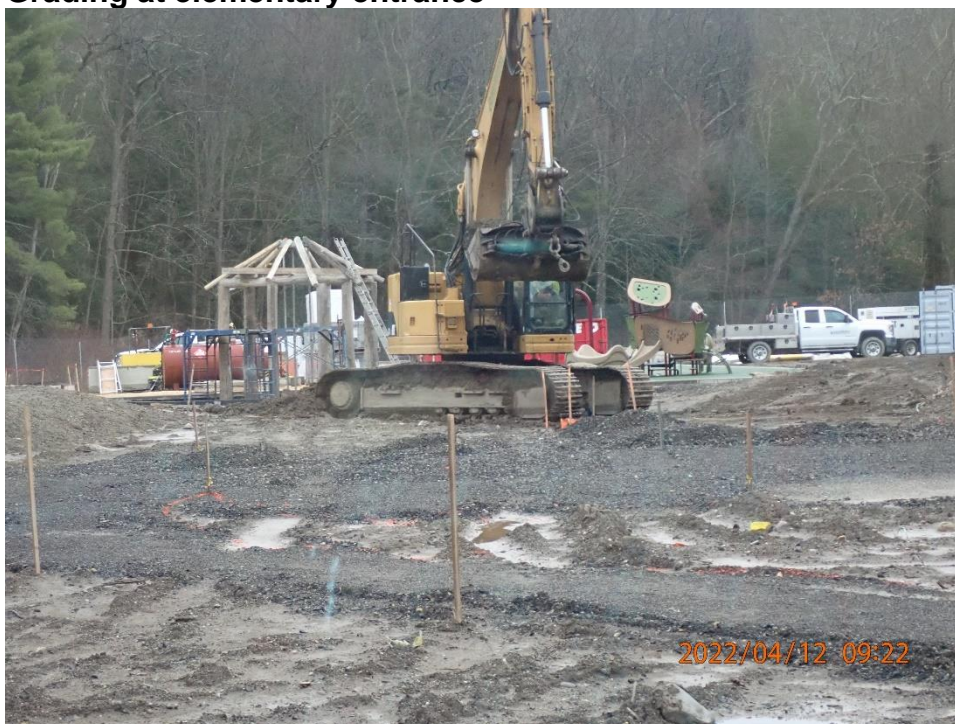
Working between buildings E and F.