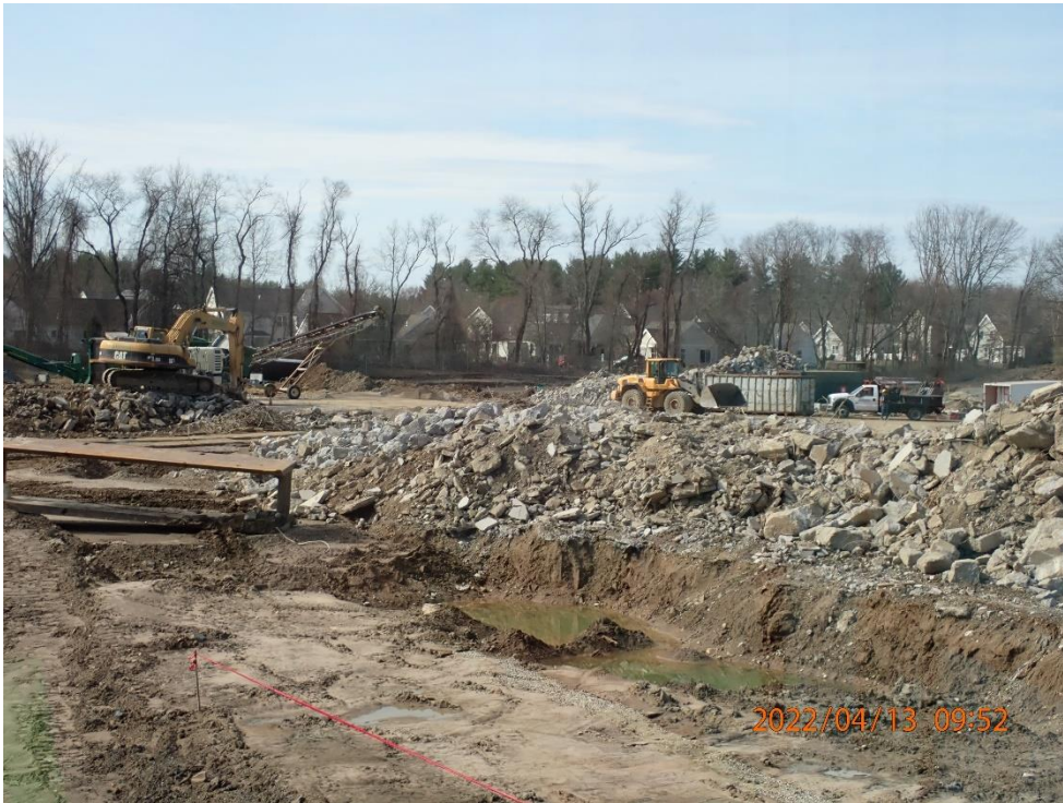
Demo of Whitebrook is complete.