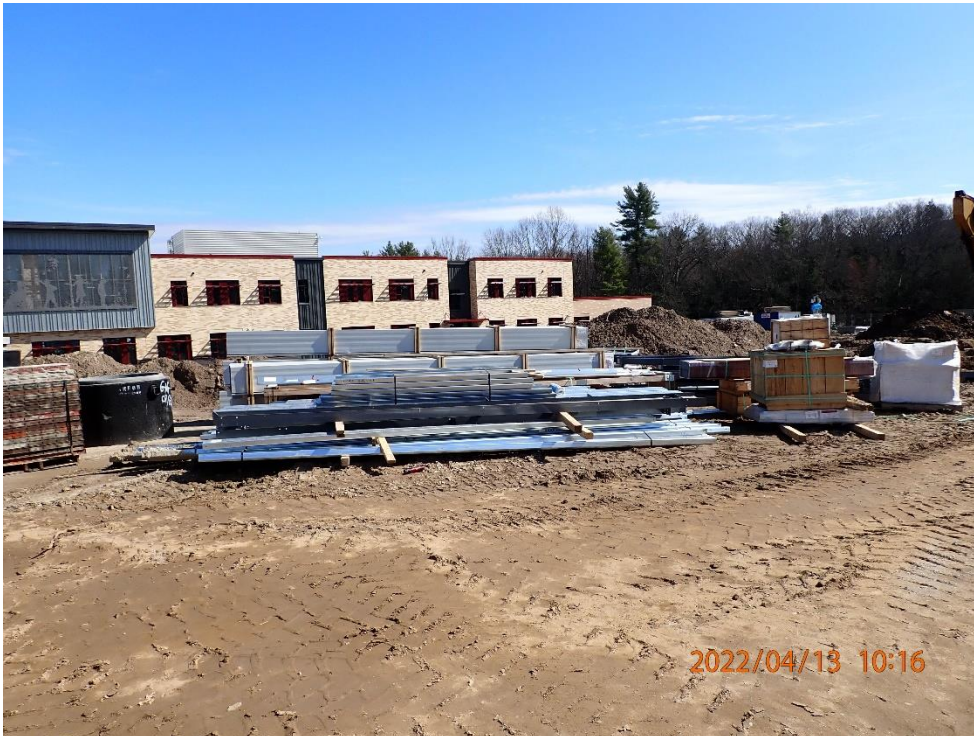
Maintenance building metal parts.