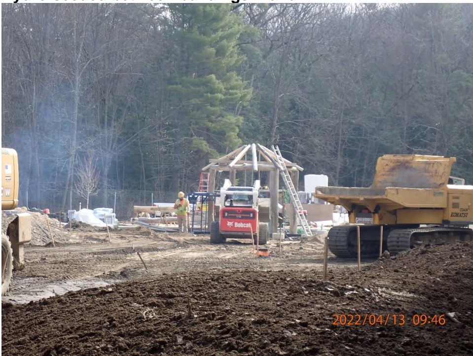
Working between E and F buildings.