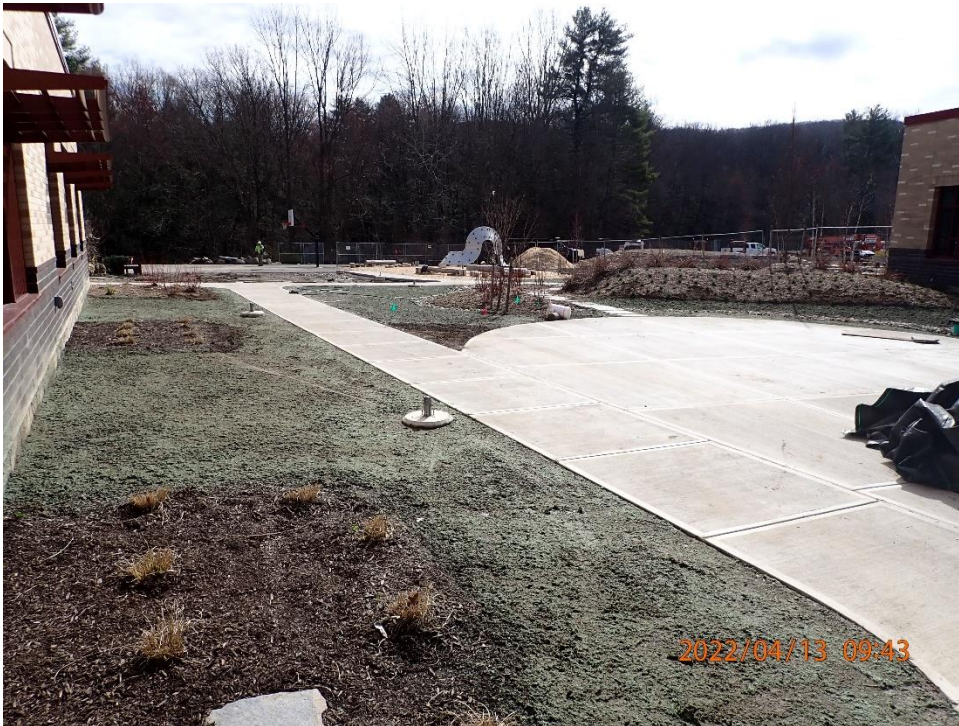
Hydro-seeded between buildings D and E.