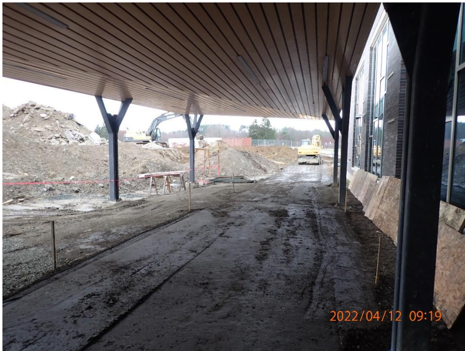
Grading at elementary entrance