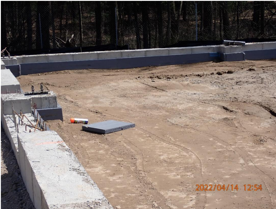
Backfilling maintenance building.