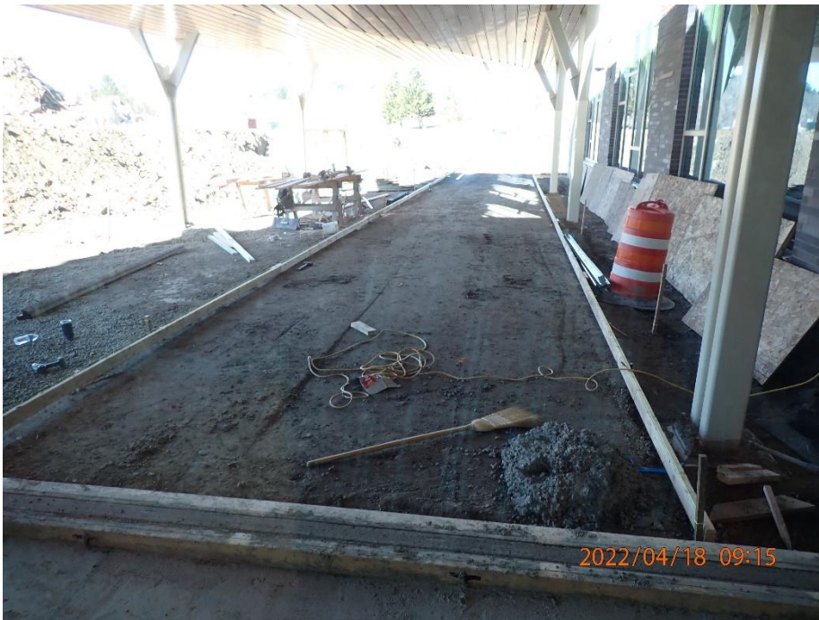
Forming slab area at entry to the elementary school.