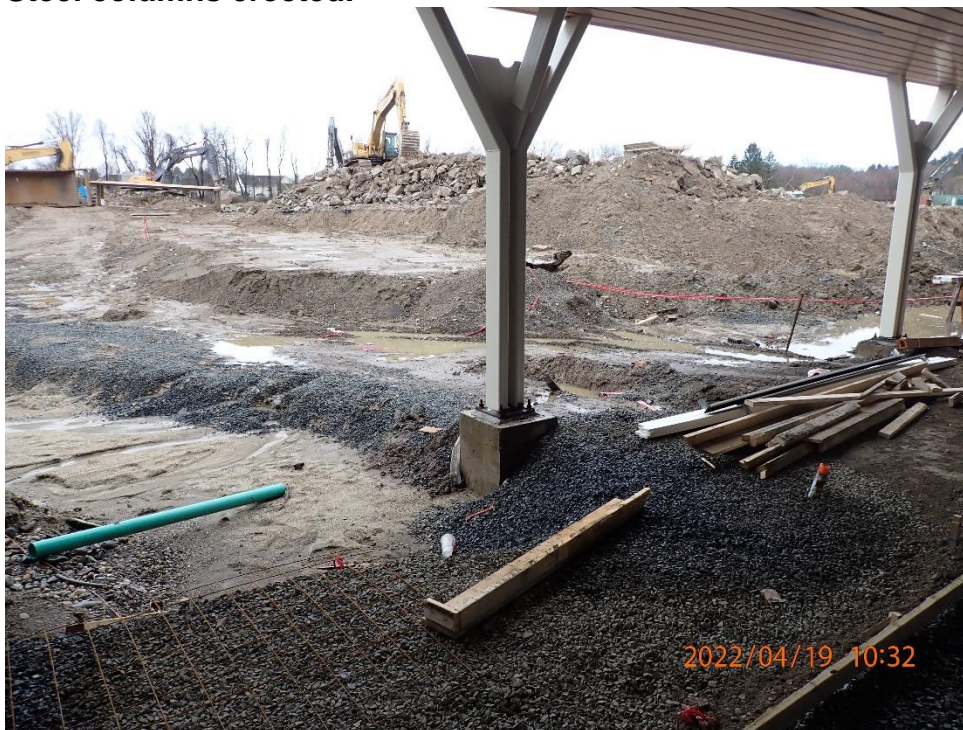
View from underside of Elementary Canopy.