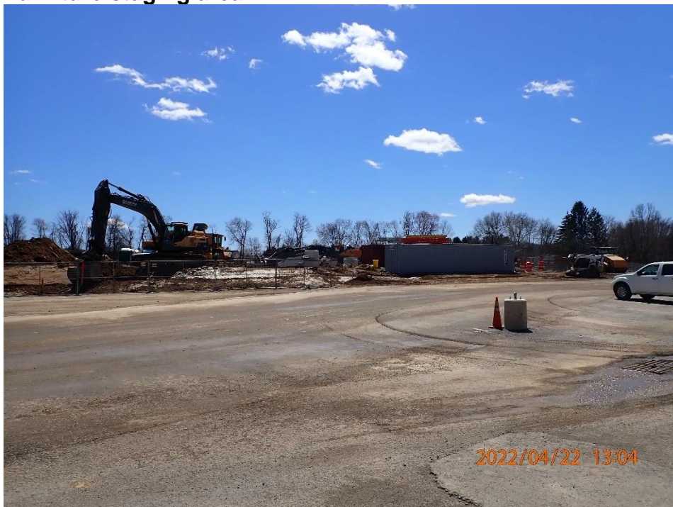
Enlarged parking lot to the South.