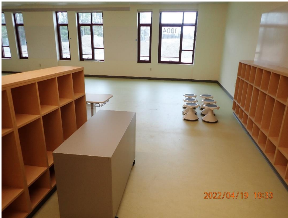
Furniture delivery in progress.