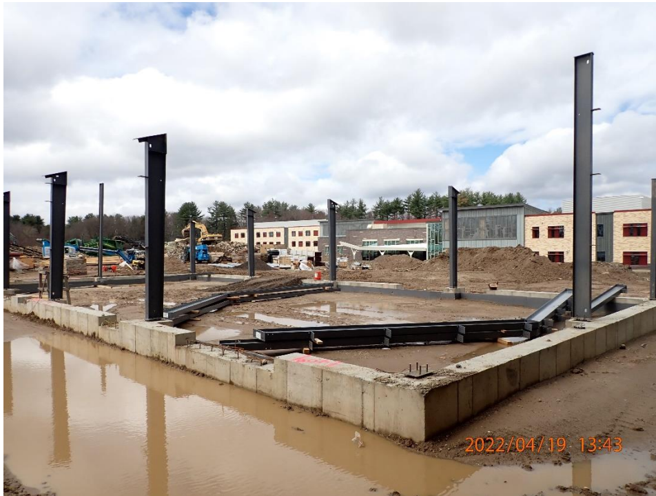
Steel columns erected.