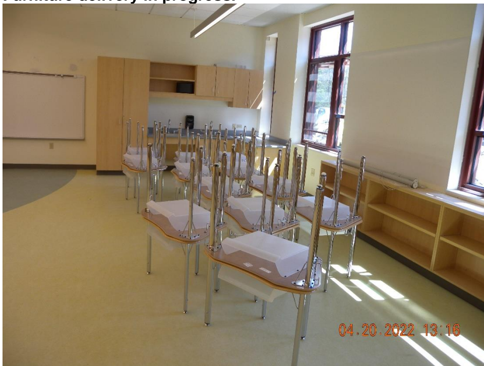
More furniture for the Elementary wings.