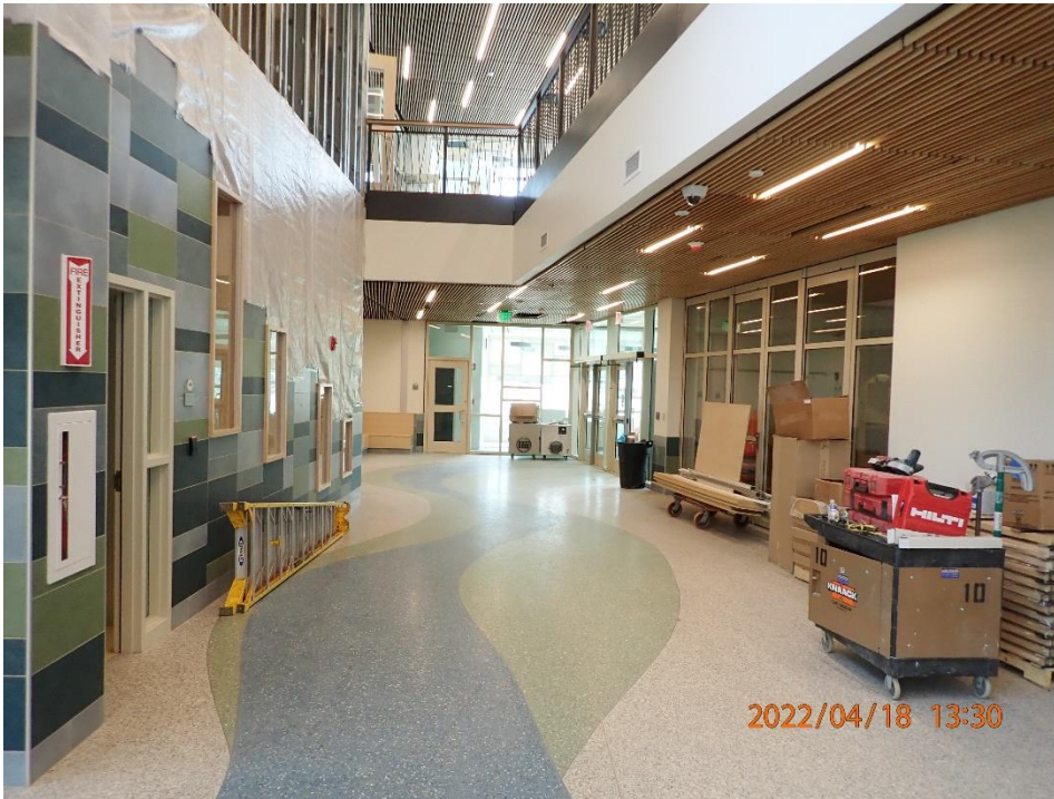
Mainstreet to Building F.