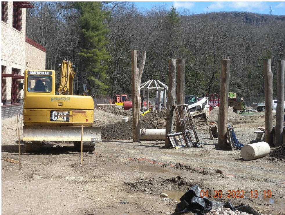
Sitework between buildings E and F.