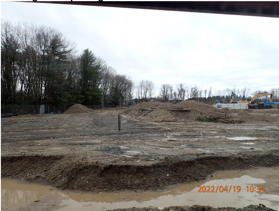
White Brook School is now Demo.