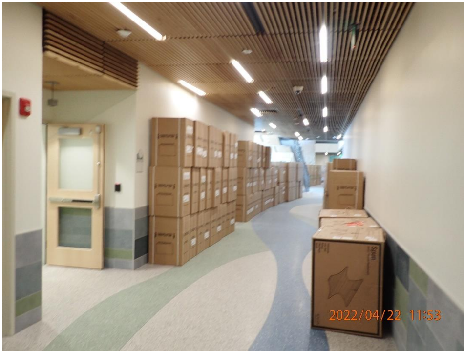
Furniture staging area.