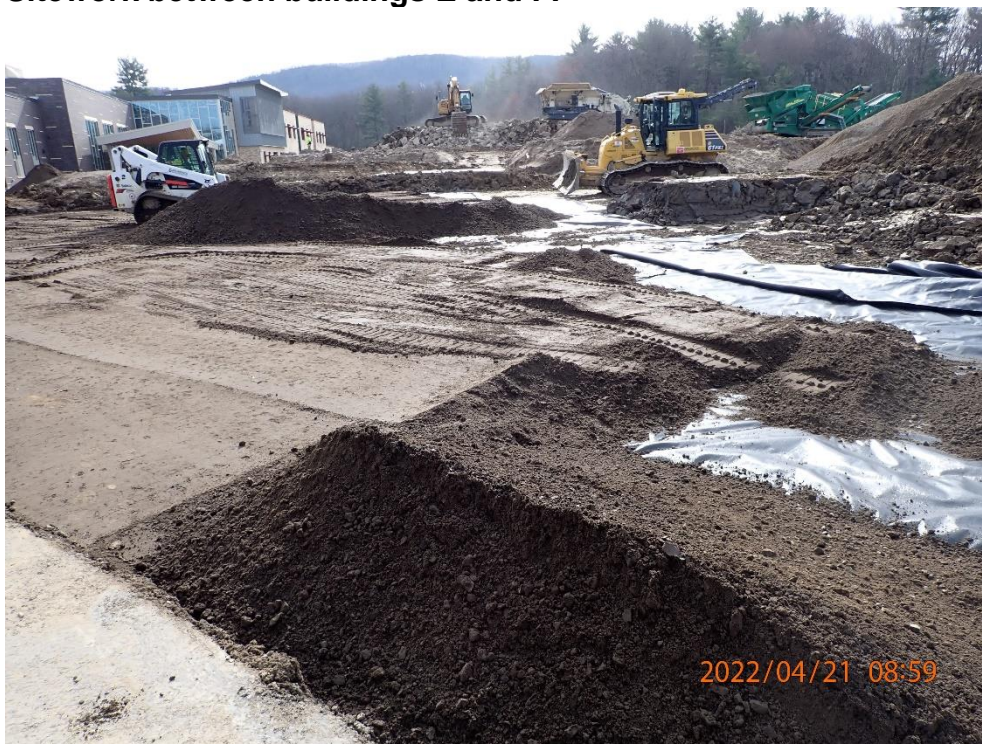
Working on the parking lot.