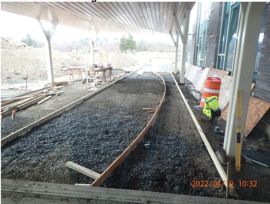
Layout continues at the entrance to the Elementary School.