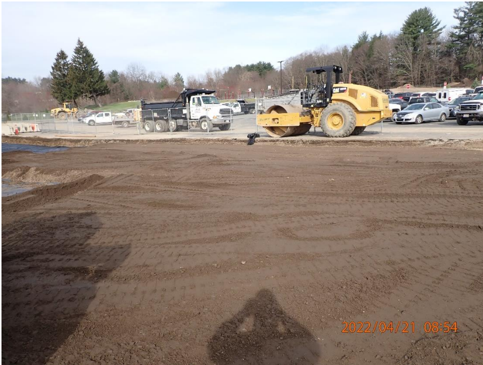
Working on the parking lot.