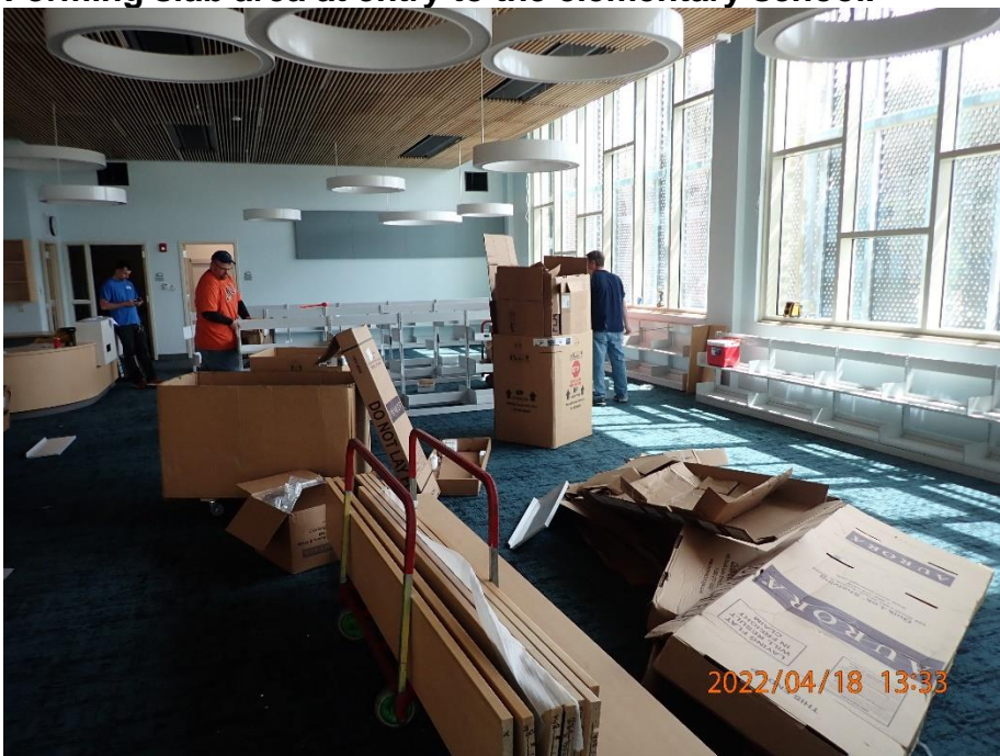
Furniture going in at the Media center at the Elementary school.