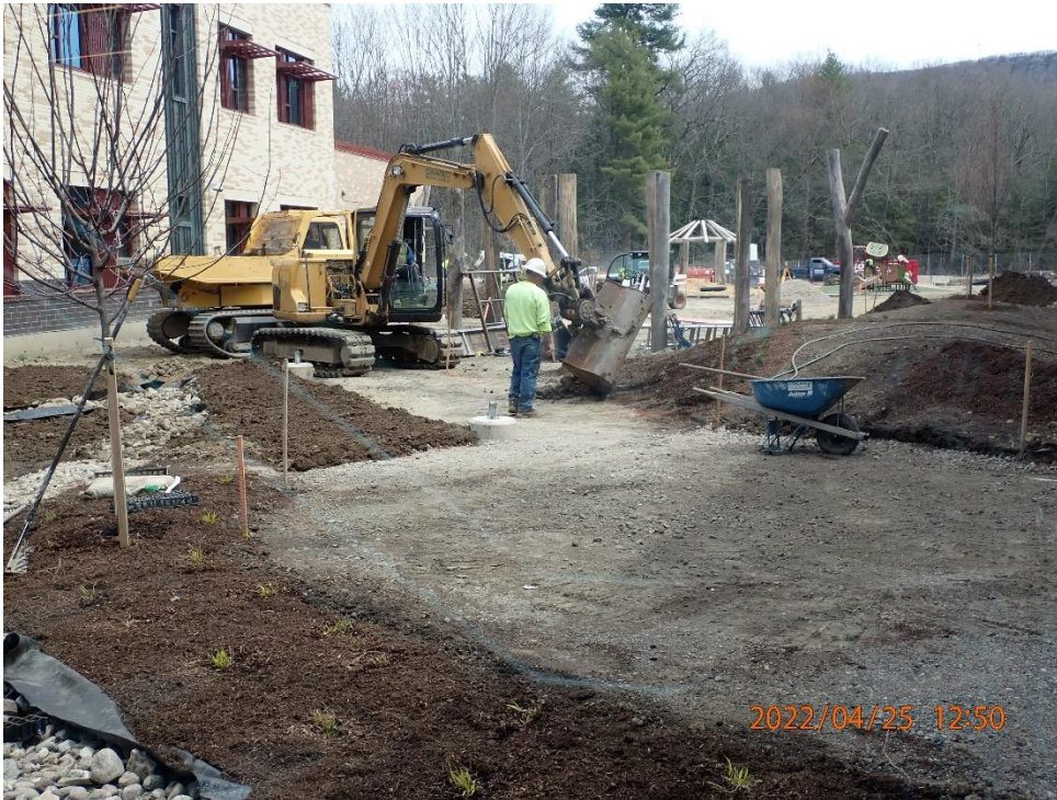
Working between buildings D and E.