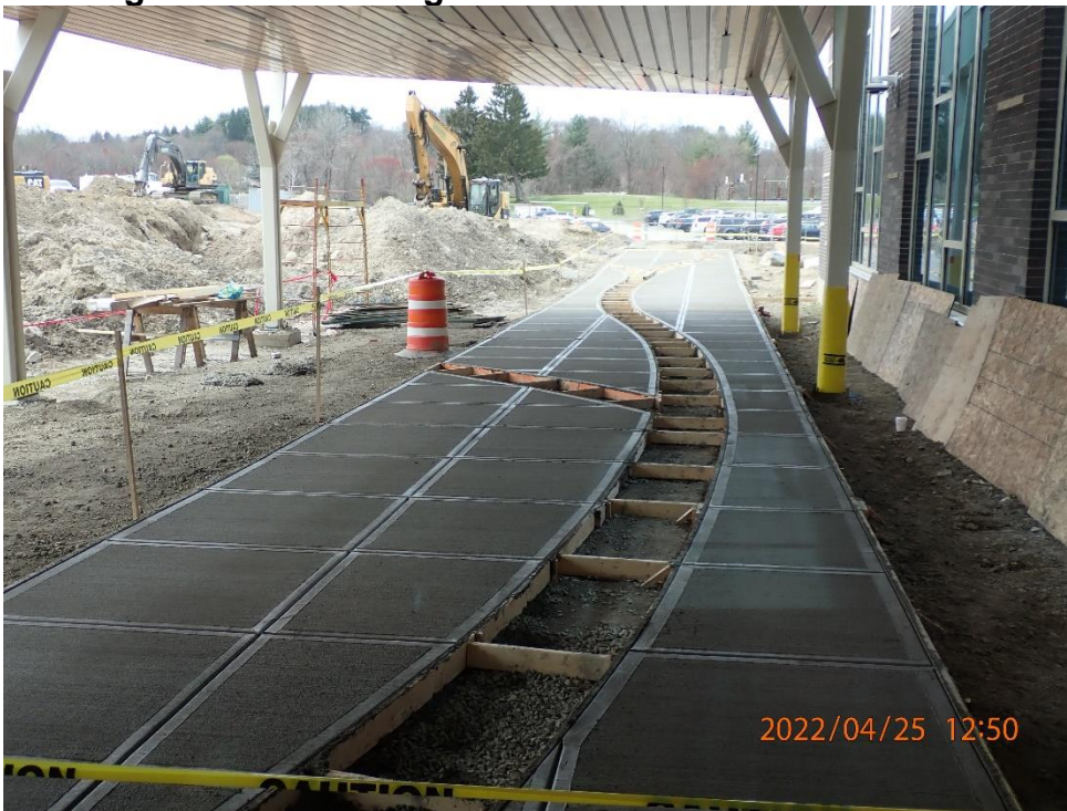
Sidewalk placed at entrance to elementary side.