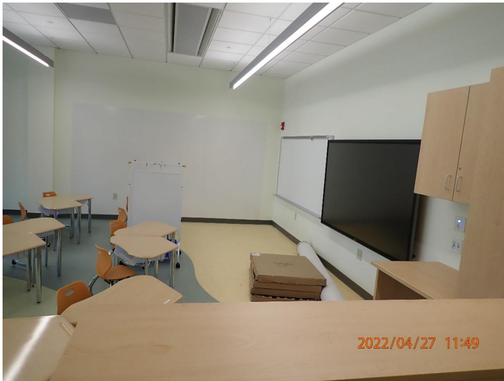
Classrooms getting prepared.