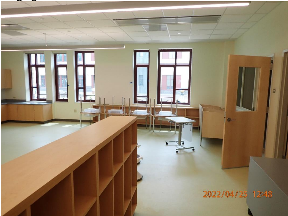
Building E Classroom.