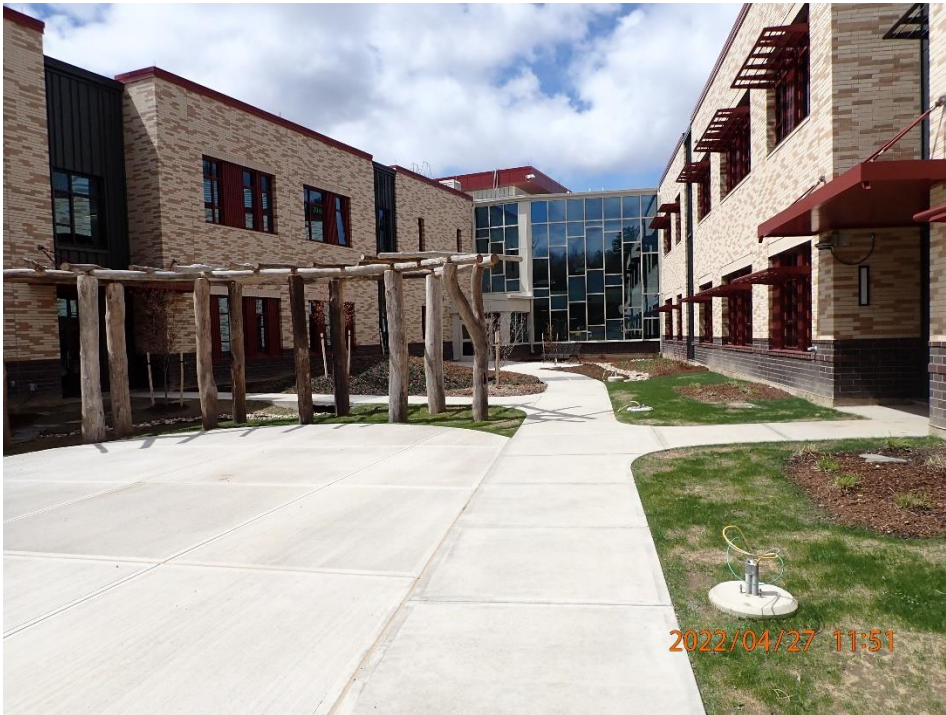
Between buildings D and E.