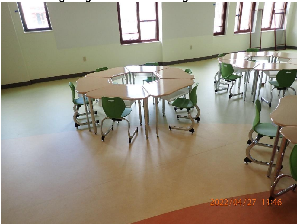
Classrooms getting filled with furnishings.