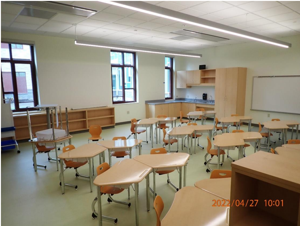
Classrooms getting filled with furnishings.