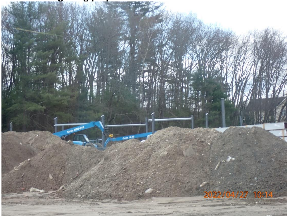
Working on Maintenance building.