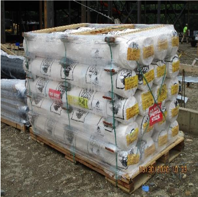
BUNDLES OF STEGO SLAB VAPOR BARRIER FILM