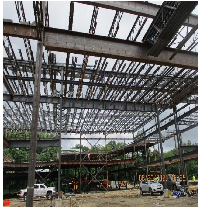
BUILDING A ROOF JOISTS